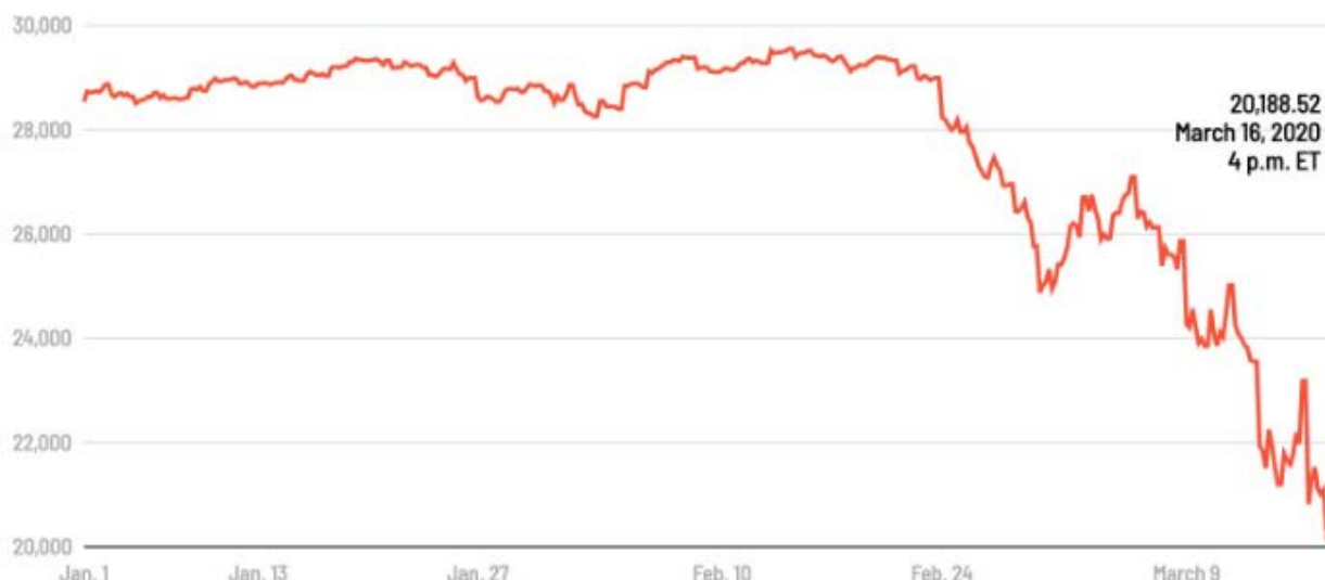
Figure 4. The negative dynamics of the Dow Jones exchange index because of the SARS-CoV-2 coronavirus