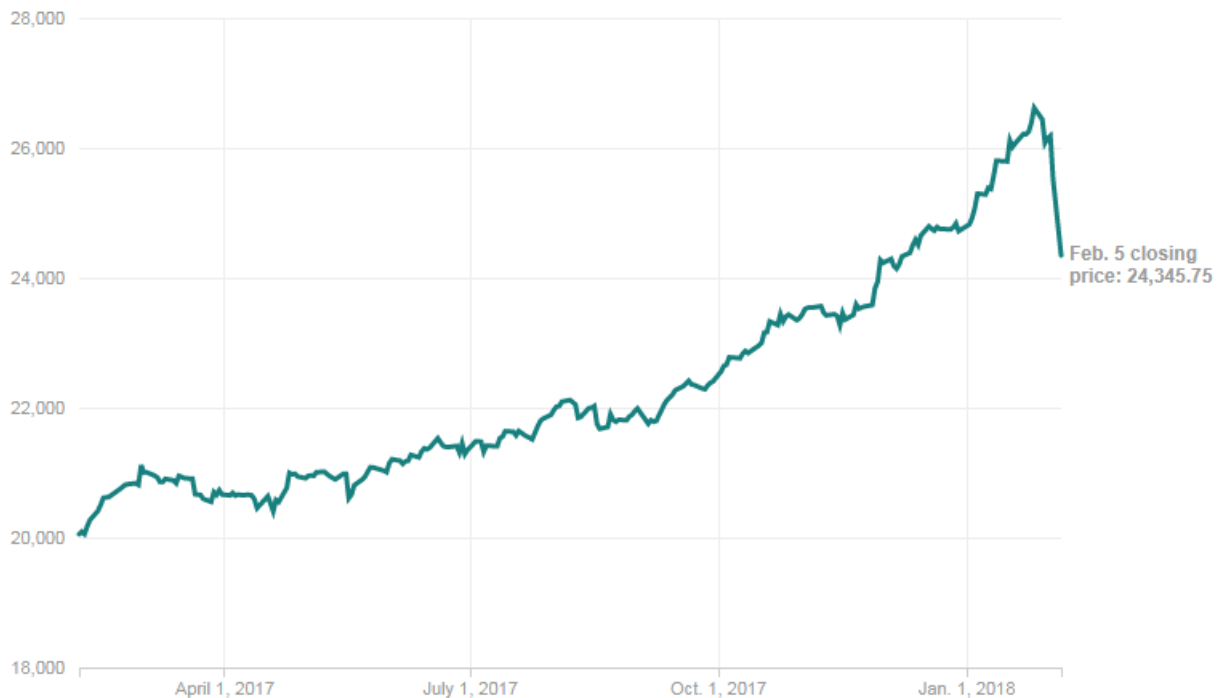
Figure 3. Dow Jones Stock Market Growth Dynamics and Unprecedented Fall 5 February 2018