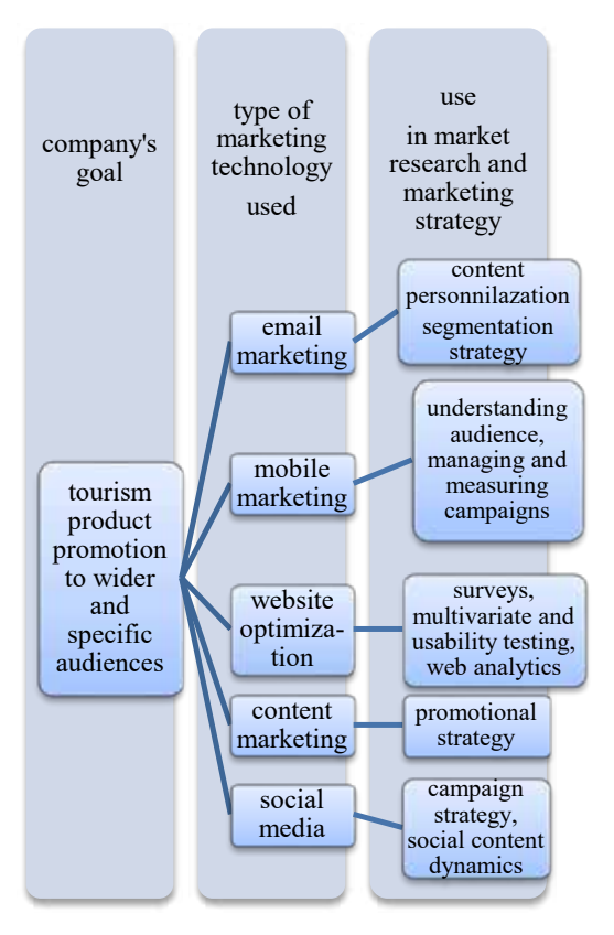
Fig. 2. Some types marketing technologies and their use in the marketing strategy

of the enterprise, the degree of market mastery, the goals, objectives and market conditions set. However, all these elements are closely interrelated. Companies cannot exclude any of them from the system, without violating its integrity. As shown in the figure 2 the marketing information system of tourism has a specific cross-sectional character, and involves various branches. In its design, we must derive from the information flow of tourism as well as from the demand for tourism.